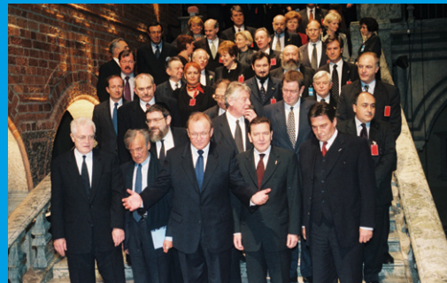
Heads of State at Stockholm Int. Forum on the Holocaust

Persson initiated the Stockholm International Forum on the Holocaust which took place from 26 – 28 January 2000 and was attended by high-level representatives from 48 countries. It was the first international political forum on Holocaust education, remembrance and research.