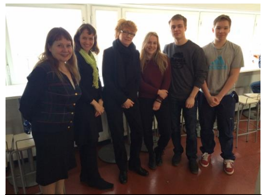
School Visit at Kallio Upper Secondary School in Helsinki