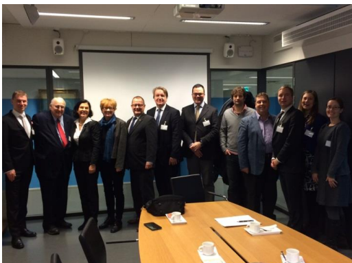
The Finnish Delegation to IHRA at the FNBE